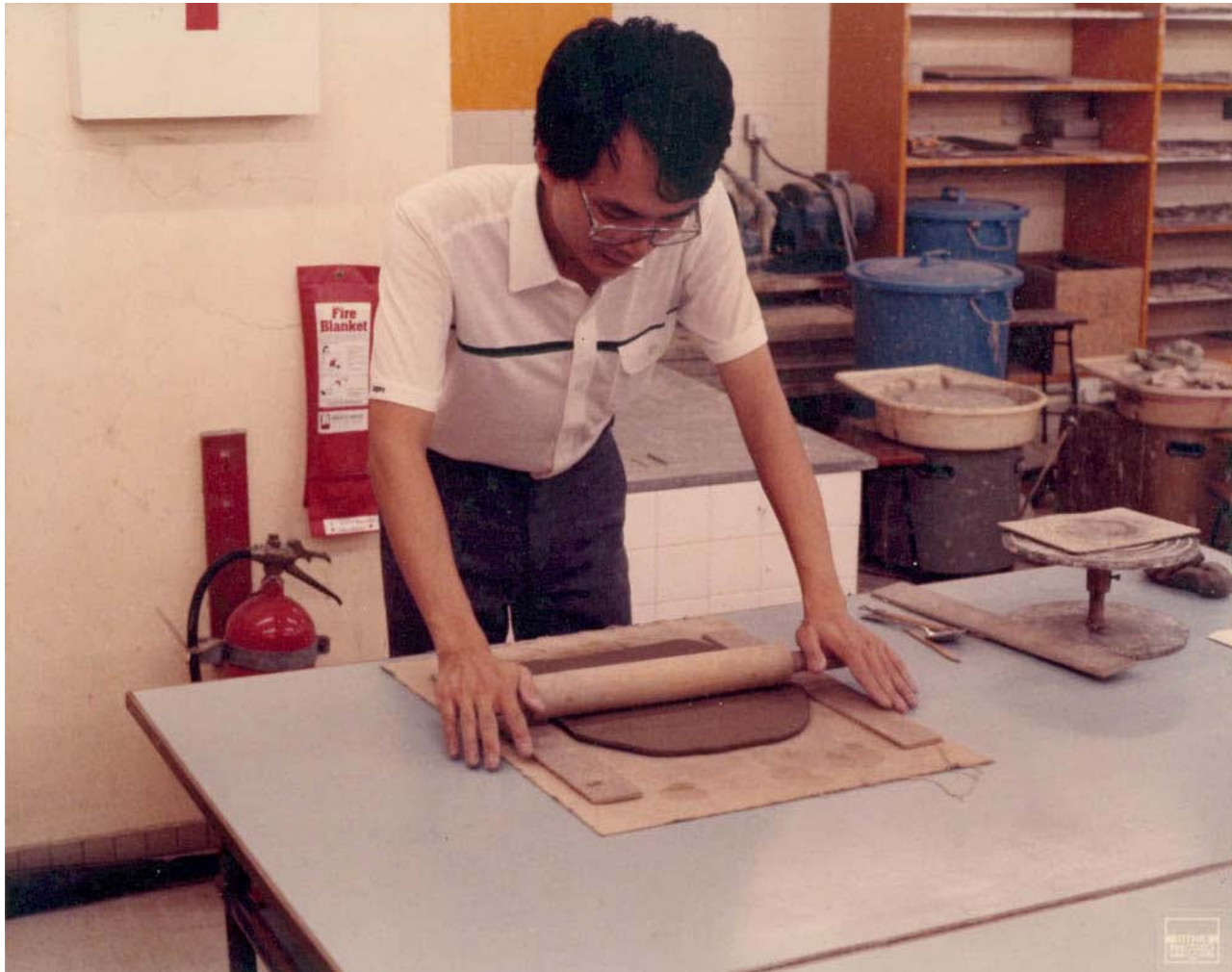
Roll the clay with a rolling pin between two strips of wooden guides.