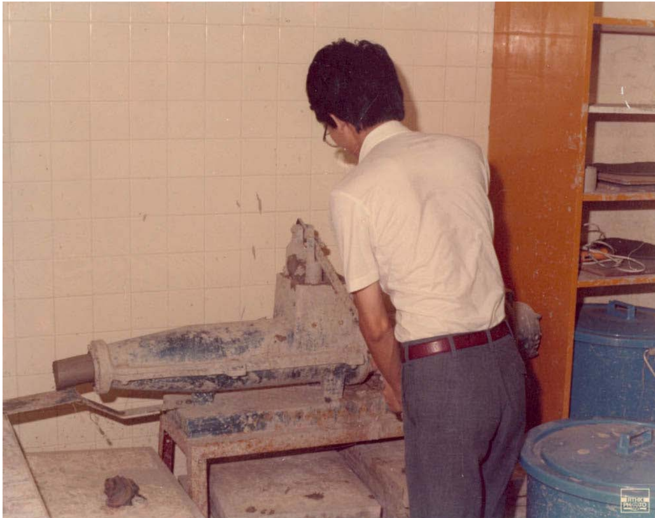
Remix clay in a walker pug mill.