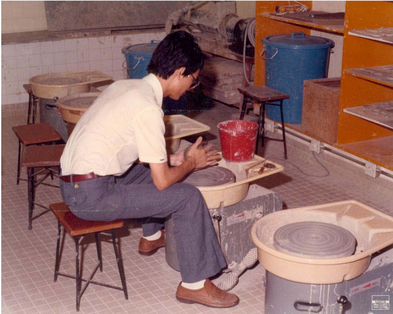
A well-wedged clay ball is pressed on the center of an electrical wheel head.