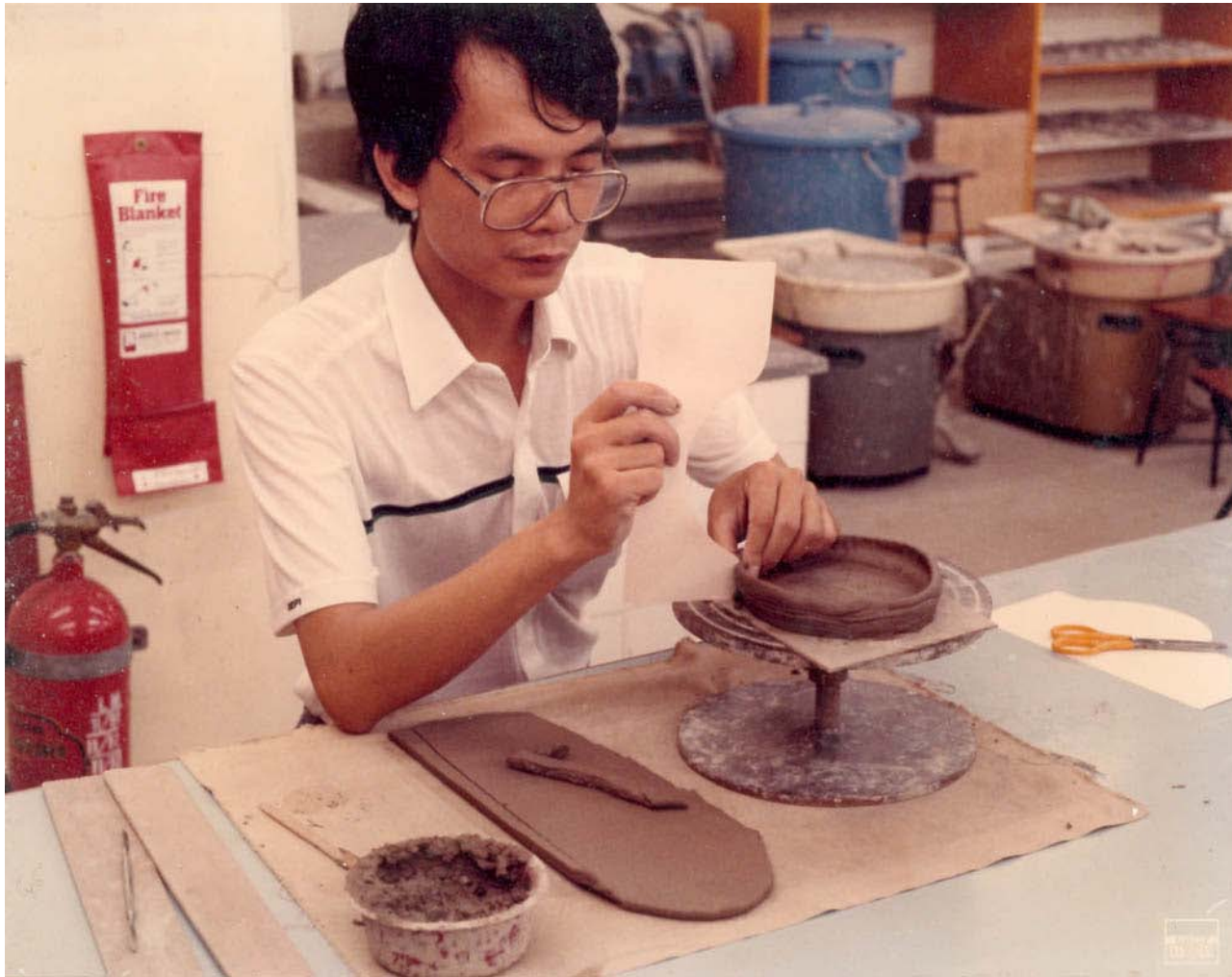
A cardboard template is held against the bowl's side to check and guide its progress.