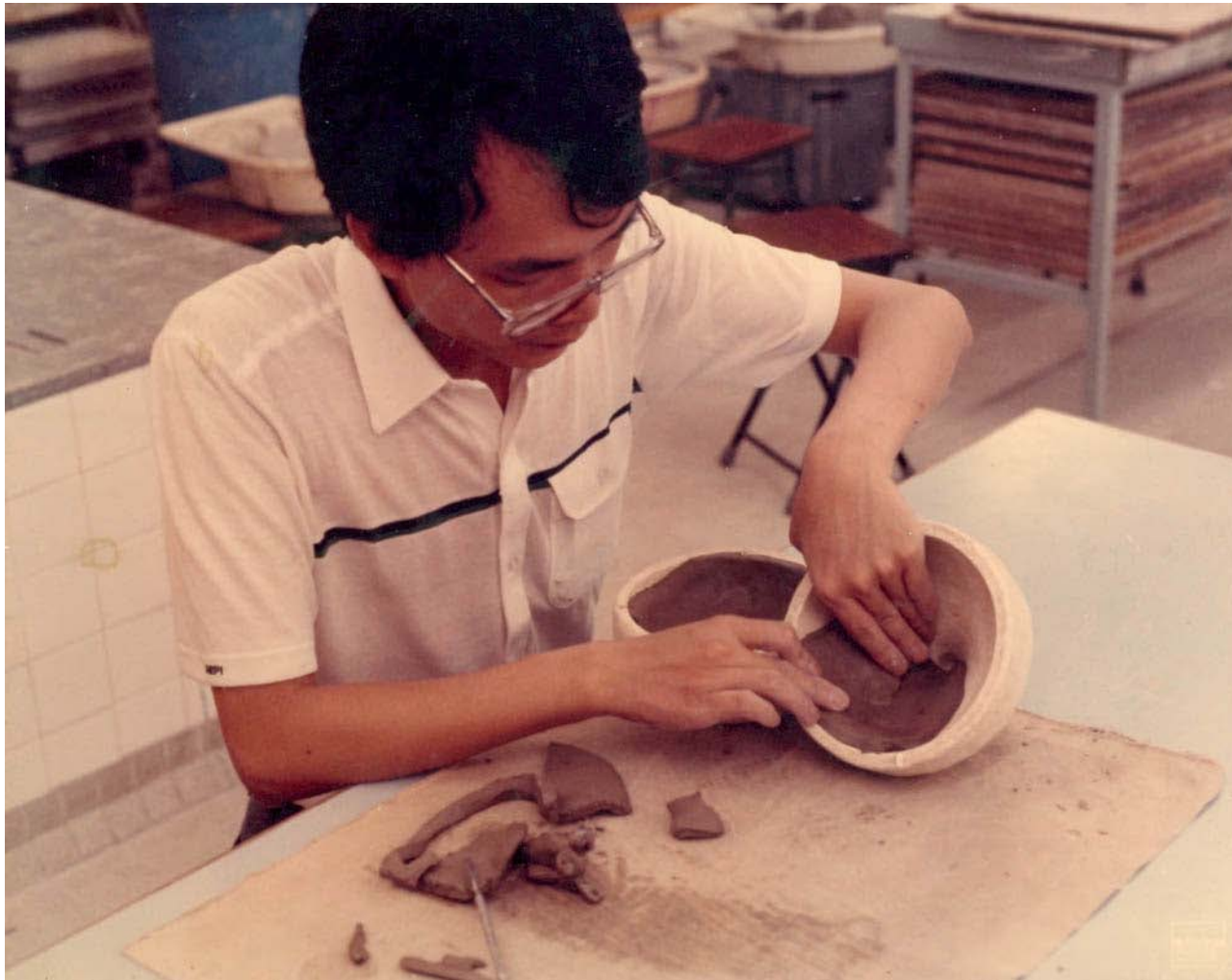
Use a mold to make a pinched form work.